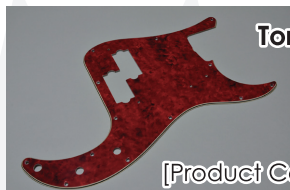
Torlam P62 #5