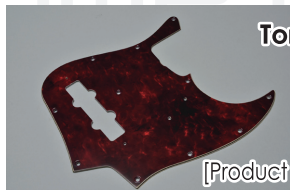
Torlam J62 #1