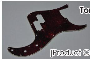
Torlam P62 #1