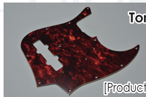
Torlam J62 #2