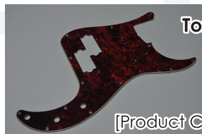
Torlam P62 #6