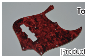
Torlam J62 #4