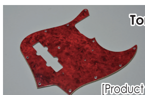
Torlam J62 #5