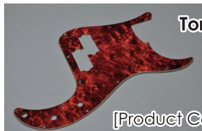
Torlam P62 #3