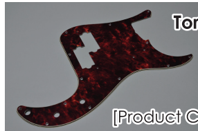
Torlam P62 #2