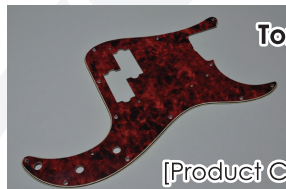
Torlam P62 #4