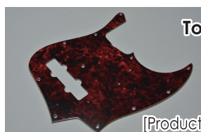
Torlam J62 #6